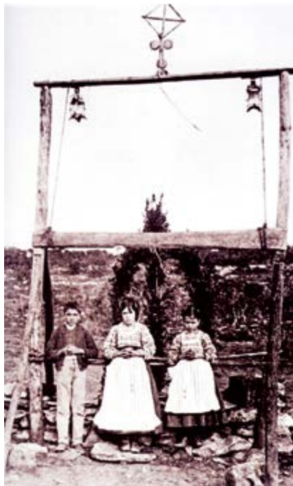
The children of Fatima standing by the tree, upon which Our Lady appeared

In June of 1921, Lucia left Fatima definitely, first for college and afterwards to enter religious life. Upon arriving at college, she was introduced to others under a different name, and was obliged "never to say anything to anyone regarding the events at Fatima." For four years, day after day, she had to carry the very heavy cross of obedi-